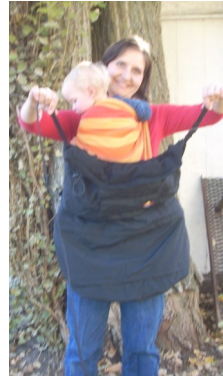
Lift top straps over baby