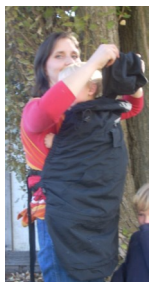
Take hood out of pocket inside neck