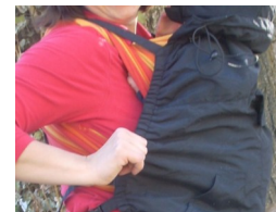
Elastic on front will keep the heat generated between you and your baby in your cover to keep baby warm