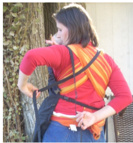
Cross on your back and buckle them on both sides