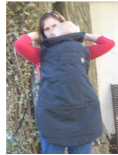
Place of your shoulder to your back