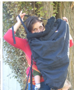
Place over your head