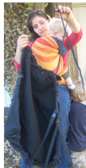
Undo one shoulder strap and buckle other in other top buckle