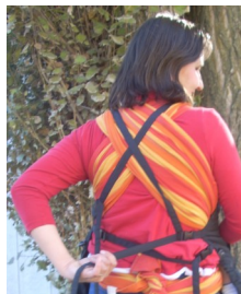
Adjust lengths as desired