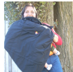
Nurse discreetly wherever you are