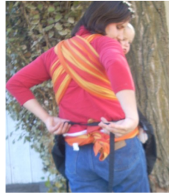
Adjust lengths as desired