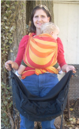
Take baby cover on the Bottom buckle