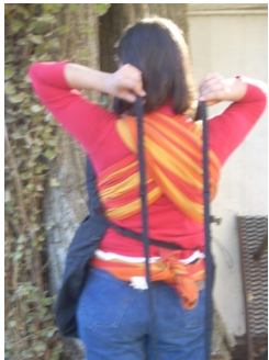
Lay flat on your back