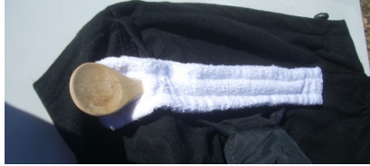
Use your wooden cooking spoon and insert it in the middle opening of the terry cloth head rest.