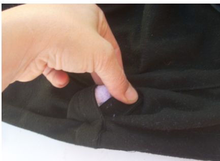
Close hook and loop tape again