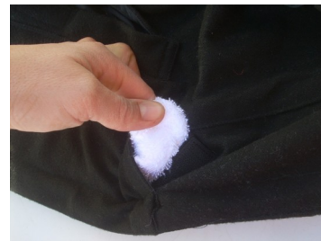
Take tip of the terry cloth headrest and push into opening.