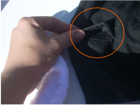
Look for the hook and loop tape closure on the top side of the baby cover