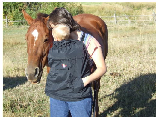
Holds baby's head gently as you move around.