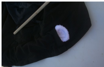
Pull cooking spoon out