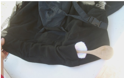
Push cooking spoon all the way down, hold terry cloth head rest between your fingers to secure in place.