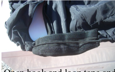
Open hook and loop tape and close around elastic and finish zippering piece in.