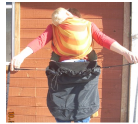
Hold top straps in both hands and pull up