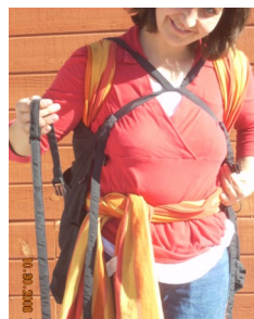
If you don't like the hip strap, you can simply take it off.