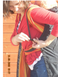
Variation— bring strap over shoulder like back-pack and close buckle