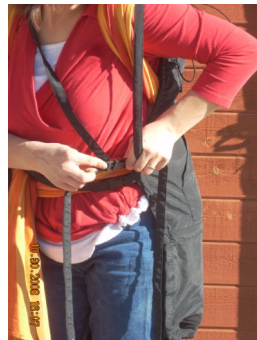
Cross straps in front and close buckle