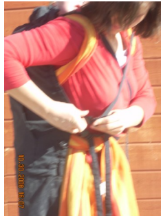
Close other buckle