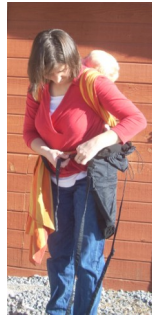
Snap bottom Strap together