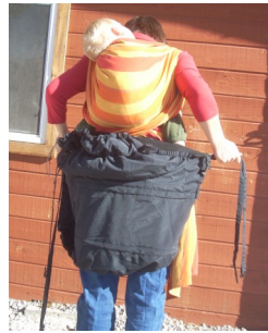
Bring around your back below your baby