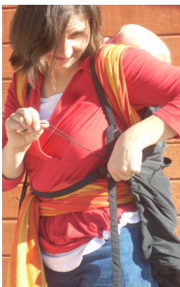
Adjust drawstring around legs of your baby