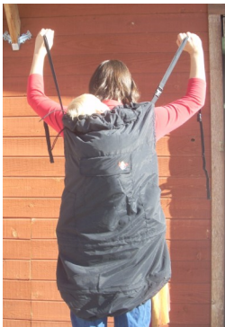
Pull up to the neck Of your child