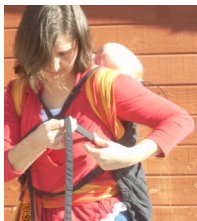
Variation: make a half knot across your chest and then snap buckles