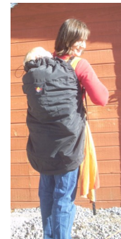
Comfortable, warm, and secure all snugged on your back.