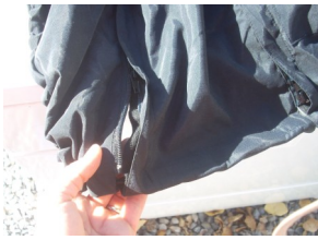
Open zippers, zip in extra piece